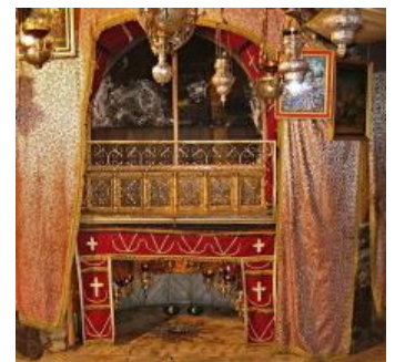
The Place of Christ’s Birth, Basilica of the Nativity, Bethlehem

So let us hasten to witness to the Christ Child so that all may come to worship Him who gives us life. Let us stand in awe before the Cave, and let us share with all the Divine Mystery of love that unfolds there, the love of a God Who is here with us now and forever.